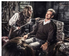
The Torture Show