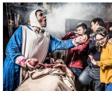
The Great Plague Show